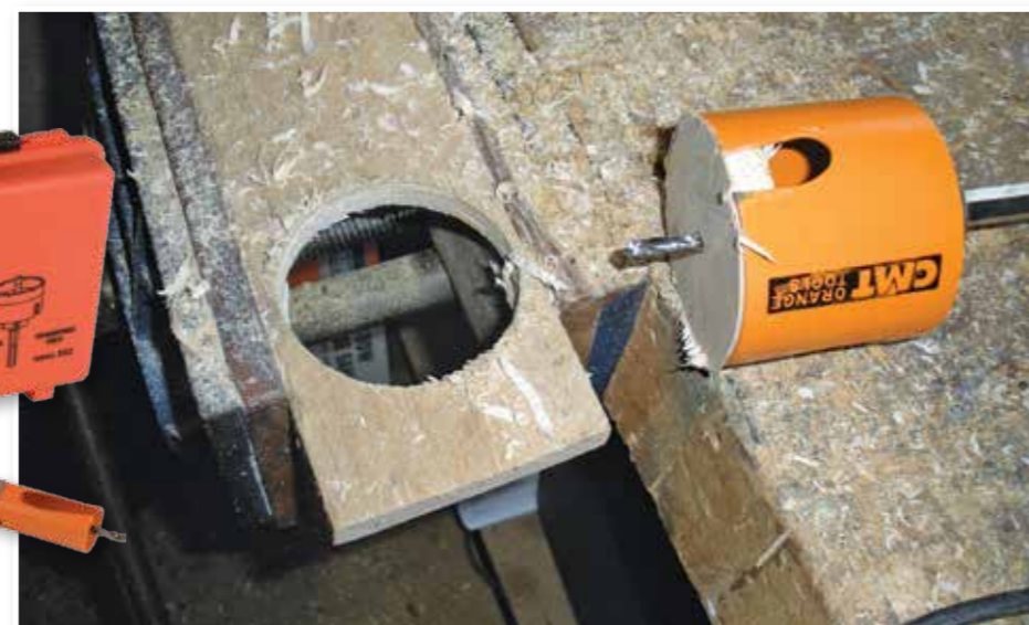
TCT tips made hole boring very easy

James Gillies: I found the instructions were not really required as the tools were simple to operate straight from the box. At present I use unbranded hole saws at an amateur hobbyist/cottage industry on a minor scale. Without a doubt, the CMT orange