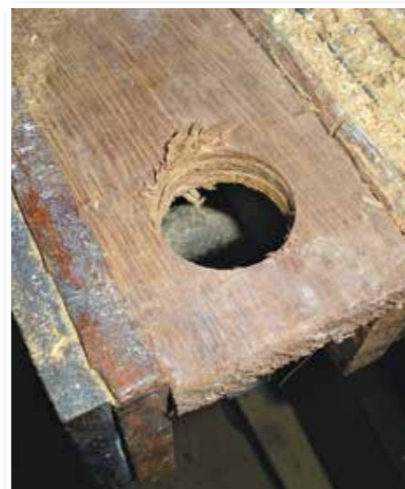
In coarse ply, there was some ragging