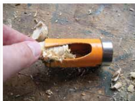
Russell Groves showing how easy plug could be reworked