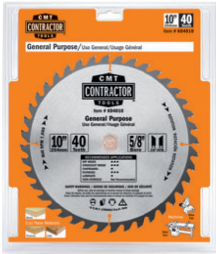
DELIVERED IN A UNIQUE CMT CLAMSHELL CASE.